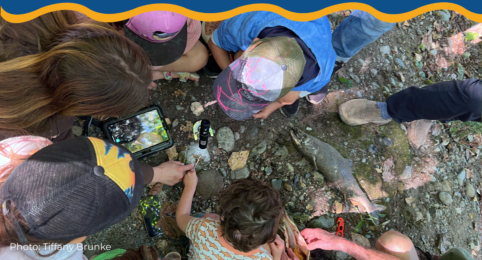
Below: Kids enjoy observing dead salmon eggs through a handheld microscope with Squamish River Watershed Society.