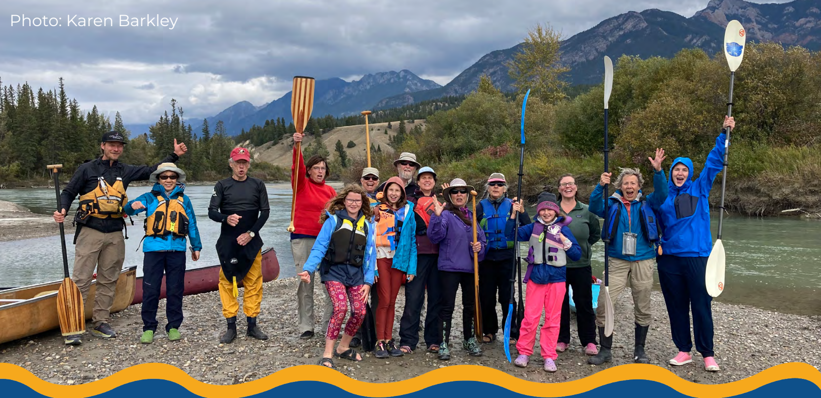
Above: Wildsight Invermere paddled down the Columbia River with 18 people from 13 to 75 years old.